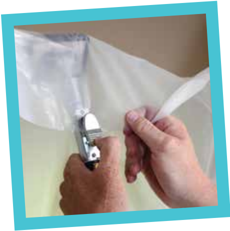
clip plastic onto quick clip

Trimaco's Heavy Duty E-Z Up® Dust Containment Pole works with plastic sheeting to create a dust barrier on the jobsite. The heavy-duty aluminium construction is available in three heights - 12ft, 16ft and 20ft. Simply clip plastic onto the quick clip and adjust the pole to ceiling height. The unique foot pedal ensures a snug fit.