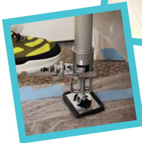
foot pedal for snug fit