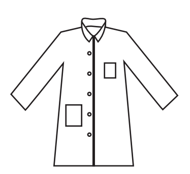
Button up jacket with open wrists and 2 pockets

XL sizing: sleeve length: 30" under arm to bottom: 31.25" hip width: 23"