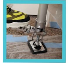
foot pedal for snug fit